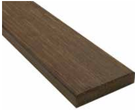
1 x 4 x 6 Eased Edge