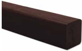
BO-DTHT2173-2 2 x 2 1 1/2 x 1 1/2 x 79"