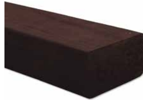
BO-DTHT2175-2 2 x 4 1 1/2 x 3 1/2 x 79"